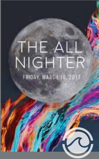
The All Nigther (Riptide: Grades 8-10)